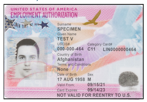
Form I-766, EAD